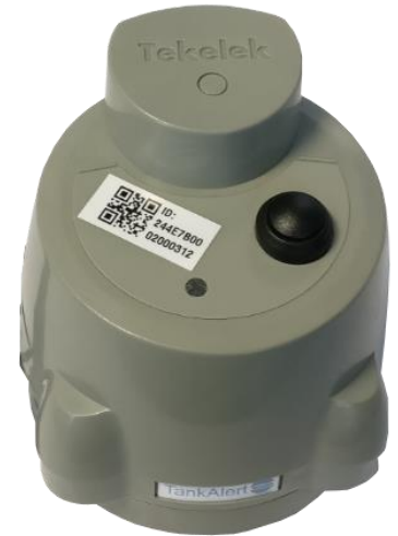
2" extended threaded mounting adaptor – Standard