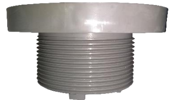
Multi Thread Adaptor Kit (1¼", 1½", 2") [Sold Separately]